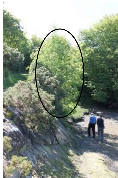
2 - Blessing stone area: Remove young tree – leaving ‘bowl’.