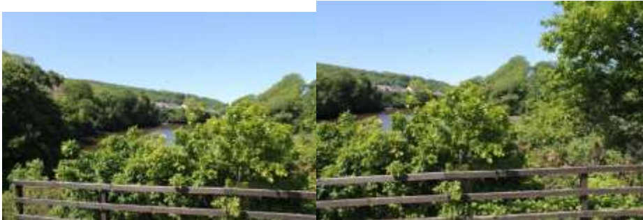
3 – trim back to fence height to preserve view.