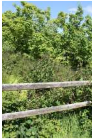
1 – remove ‘garden’ species, Box Leaved Honeysuckle ( Lonicera nitida ) and Pheasant Berry ( Levcesteria Formosa )