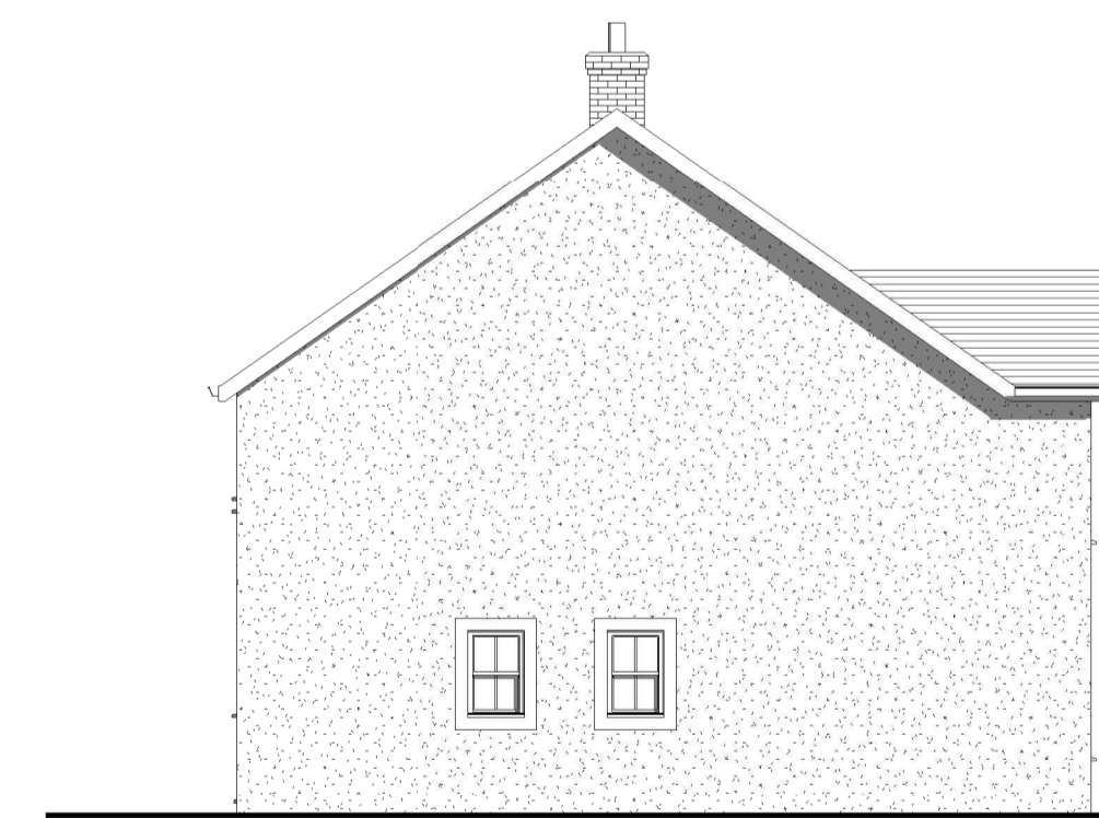
Side Elevation 1:100