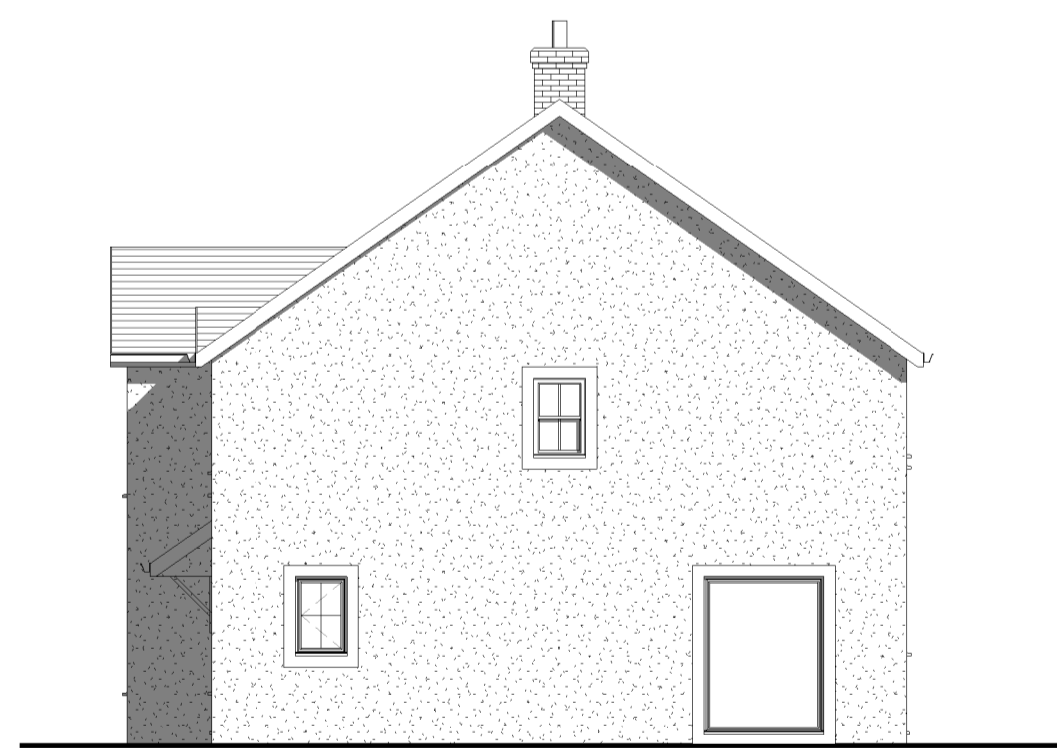
Side Elevation 1:100