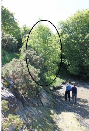
Image of area taken in previous year. Growth not as strong in autumn 22.