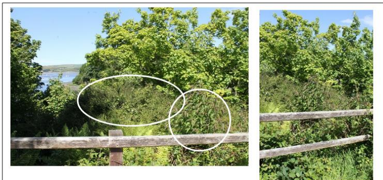
Image of area taken in previous year. Growth not as strong in autumn 22.

Cut to rail level and reduce grown height in area to cliff side of fencing. Any non-native species (previously Box Leaved Honeysuckle ( Lonicera nitida ) and Pheasant Berry ( Leycesteria Formosa )) and any small ash to be removed.